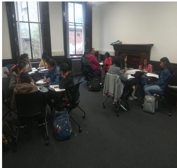
Day 10: April 5, 2023

The day started with the lecture on induction and later proceeded towards the concepts of knowledge, truth. Special focus was extended towards group argument reconstruction. Afternoon session was dedicated for worksheet F and the students were encouraged to complete the final assignment to be submitted by the end of the week