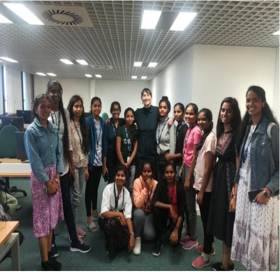
Day 13: April 8, 2023

The course concluded and the students started back to India