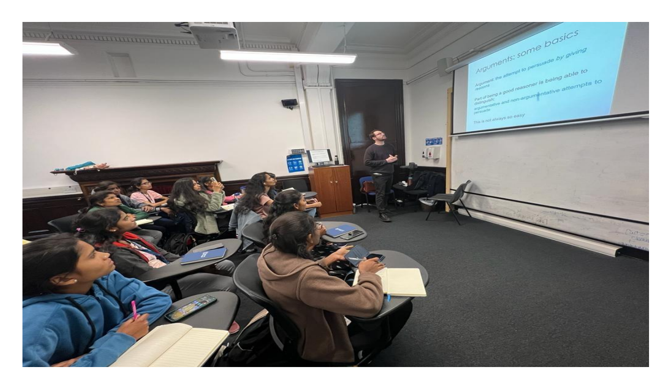
Day 4: March 30, 2023