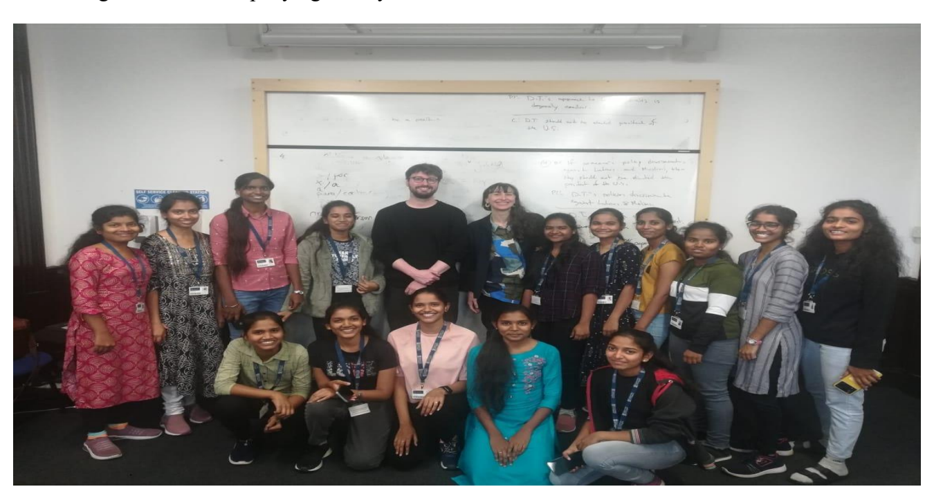
Day 12: April 7, 2023

The day started with lecture on empirical knowledge and the concepts of a priori and a posteriori was introduced among the students with examples. Later in the afternoon the students were assigned the work sheet F for practice and working on the final assignment continued in the IT department. The doubts if raised by the students were clarified by the course coordinators and the tutor along with the accompanying faculty