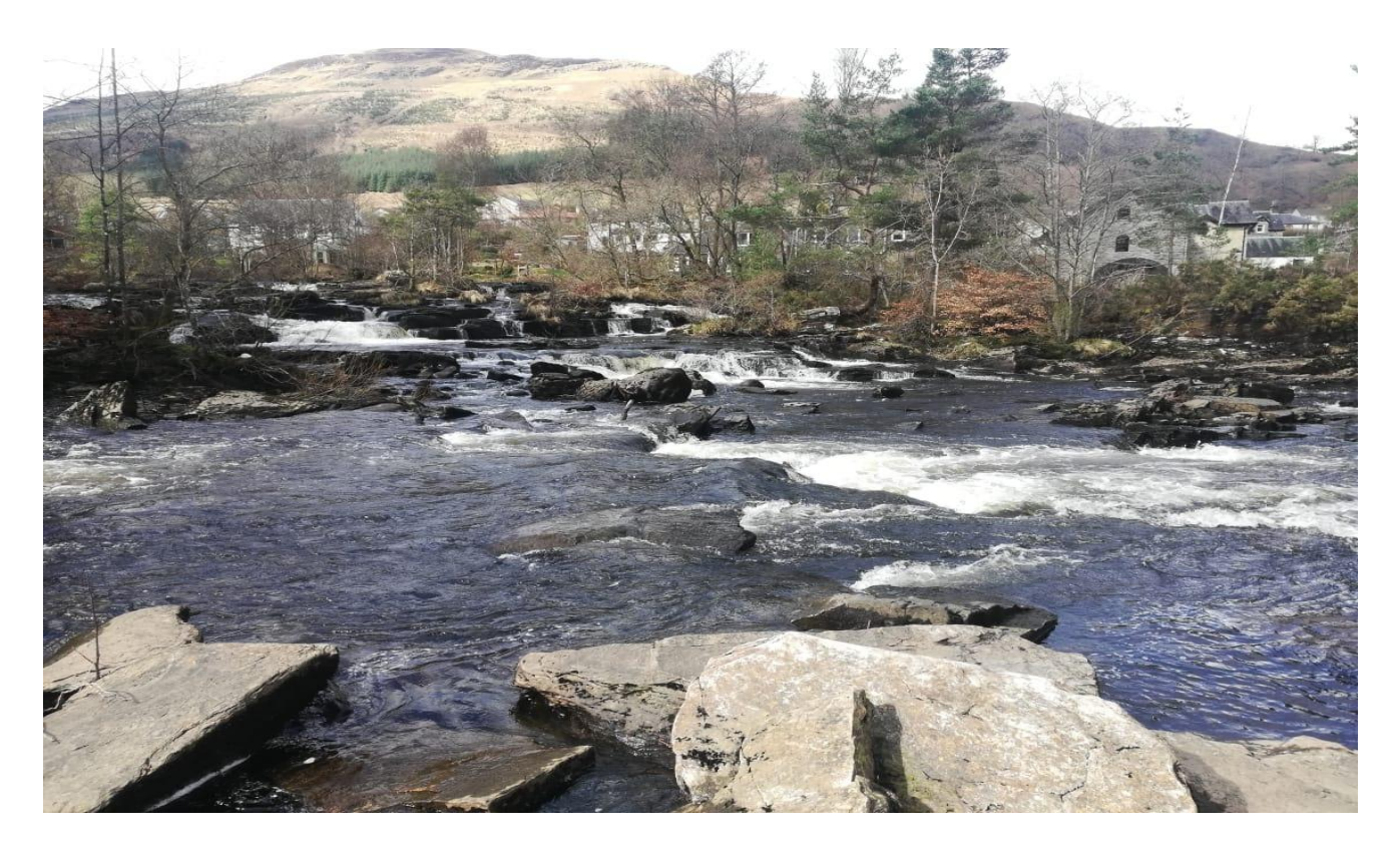
Day 8: April 3, 2023

The morning session kicked off with continuation of argument reconstruction and proceeded towards identification of rhetorical ploys. The afternoon session was dedicated for the work sheets C and D. The students worked on them in teams and faculty also joined them out of enthusiasm towards the subject. The worksheets were completed and discussed for any doubts.