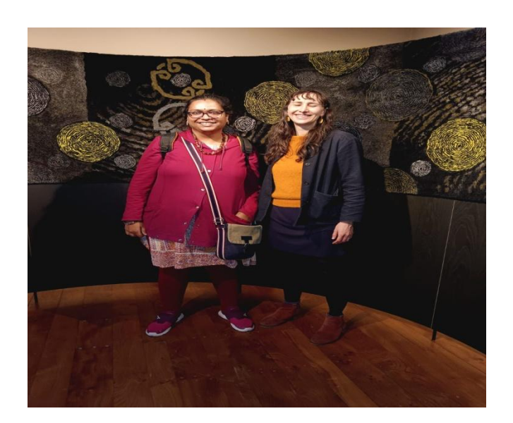
Day 9: April 4, 2023

The classes focused on argument reconstruction, identification of rhetorical plays, concept of fallacies was introduced to the students. The students were assigned with worksheet E for practicing the theoretical concepts in the afternoon and they were encouraged to work on the